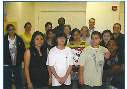
Tuesday Teen Tutoring at The Frederick,

What I love about this program is it's an opportunity for caring, interested individuals to come in every Tuesday and help students, who may not receive much encouragement either at home, school, or both. It is so tremendously worthwhile for these students to have role models, who are there every week specifically to not only help them learn, but to also encourage them, motivate them, and invest in their well-being.